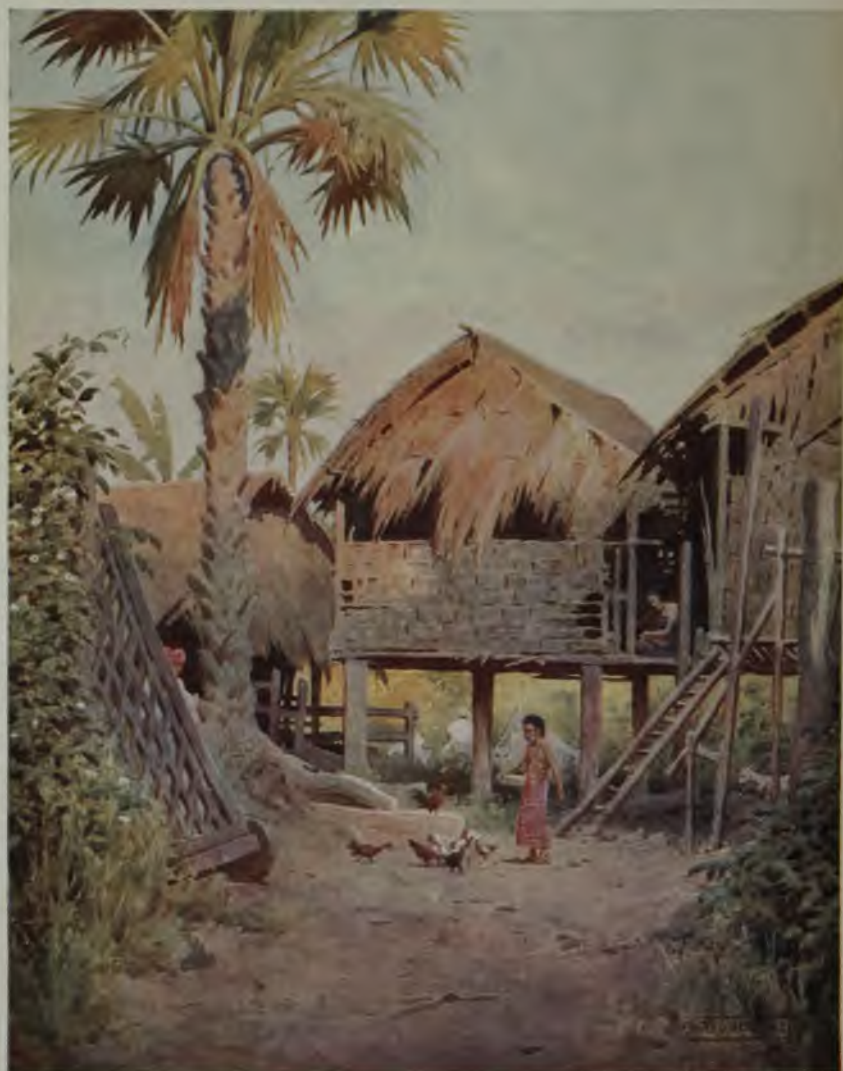
ENTRANCE TO A BURMESE VILLAGE. Page 36.